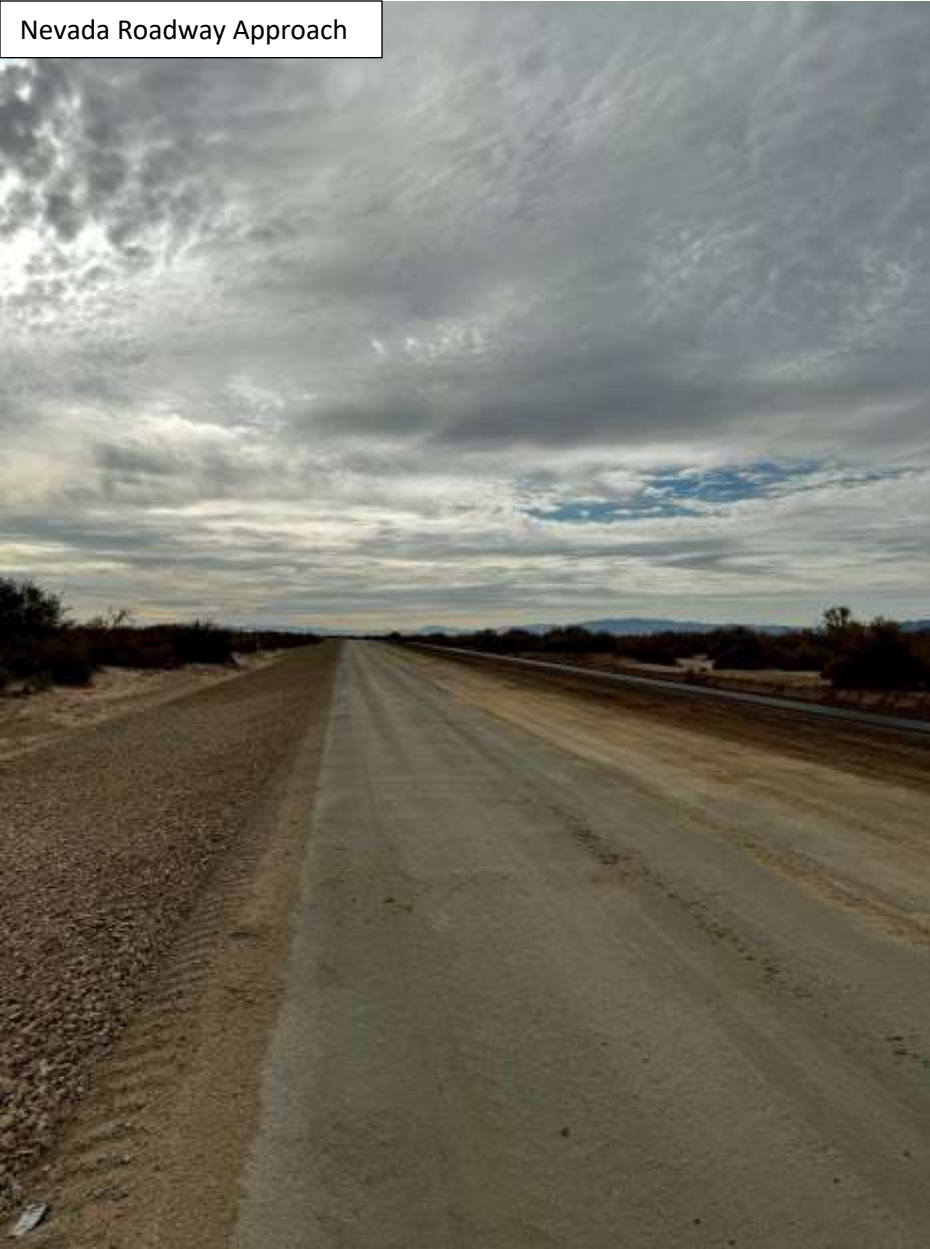
Nevada Roadway Approach