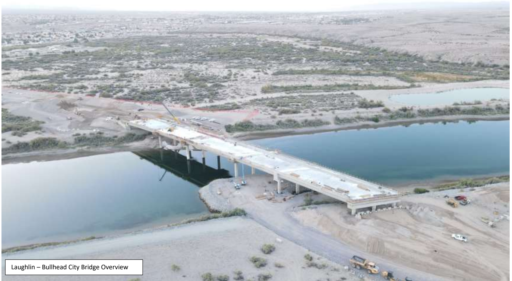
Laughlin – Bullhead City Bridge Overview