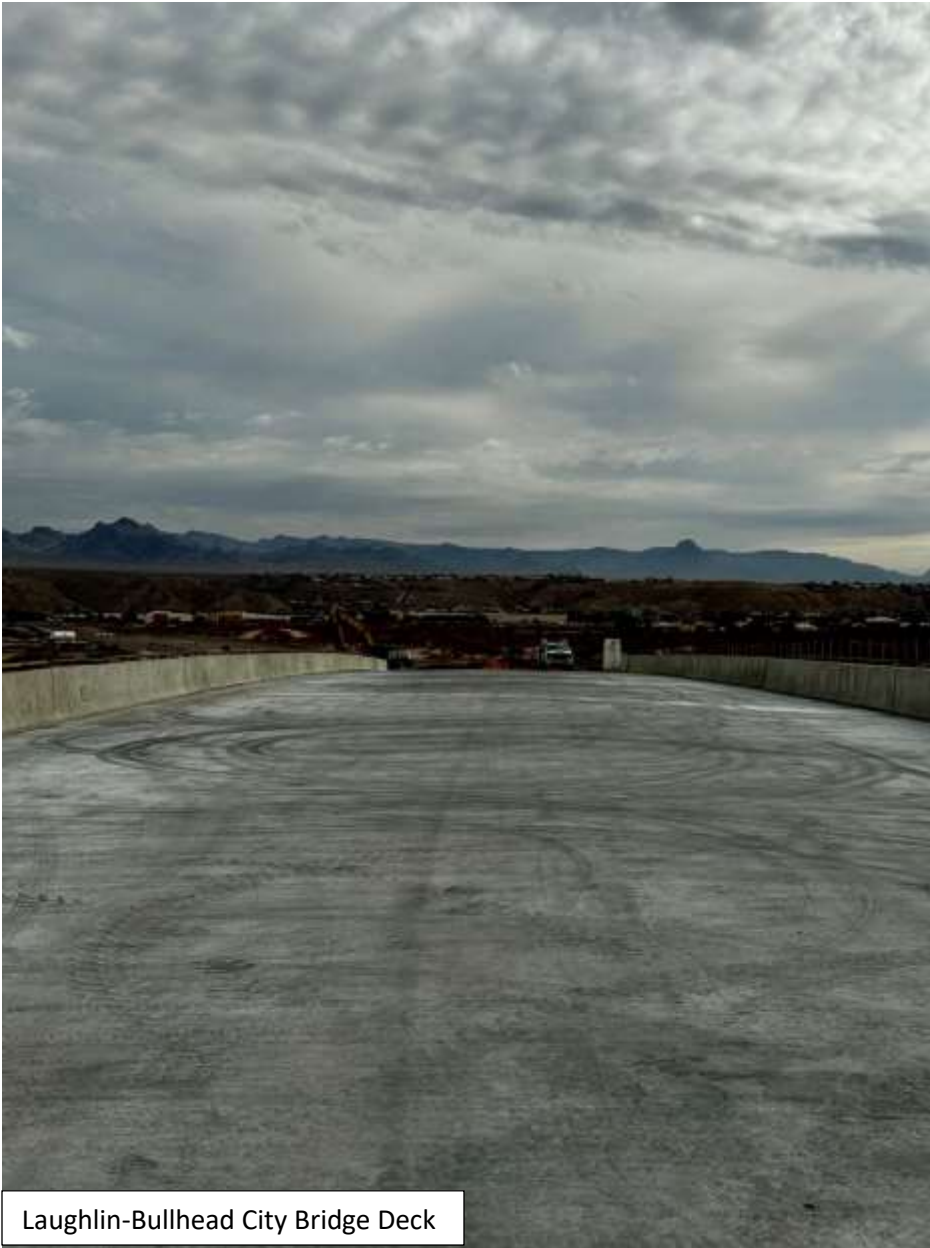
Laughlin-Bullhead City Bridge Deck